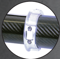
Adjustable control tube rollers

When purchasing the Tapepro SuperLite Auto Taper you not only obtain the most functional Auto Taper on the market but also the best presented tool for a professional plasterer's kit.