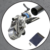
Quick release head